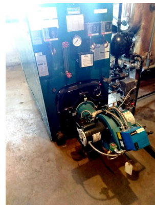
Photo of our new Boiler. This new boiler is about 2/3 the size of one of our old ones and has as much capacity to heat as all three of them did.