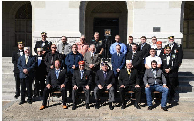
McAlester Scottish Rite Bodies October Reunion October 19-20, 2019