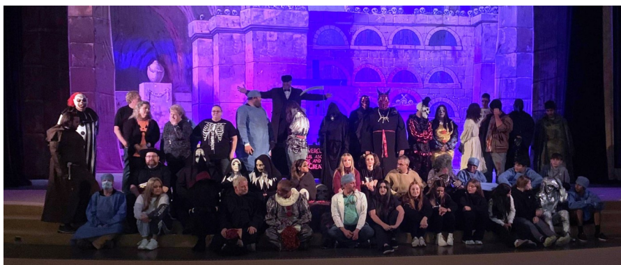
Group Picture of Actors from Haunted House

We had some great actors. The young people really got into it. Even some of them would jump if someone unexpectedly said BOO!