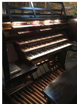
McAlester Scottish Rite's 1930 W.W. Kimball, Organ Located in the Auditorium

I believe you will find this book most interesting. It is certainly entertaining.