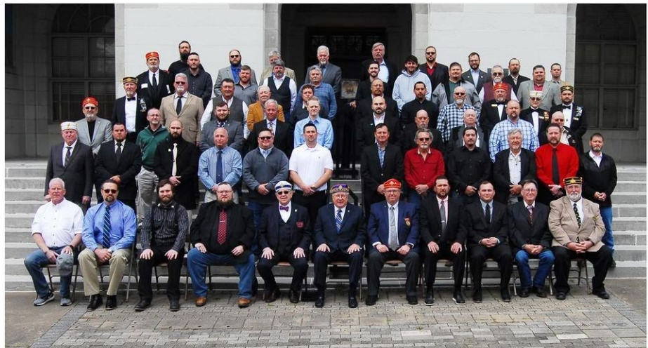
McAlester Scottish Rite Bodies 342ND CLASS REUNION April 17, 2021